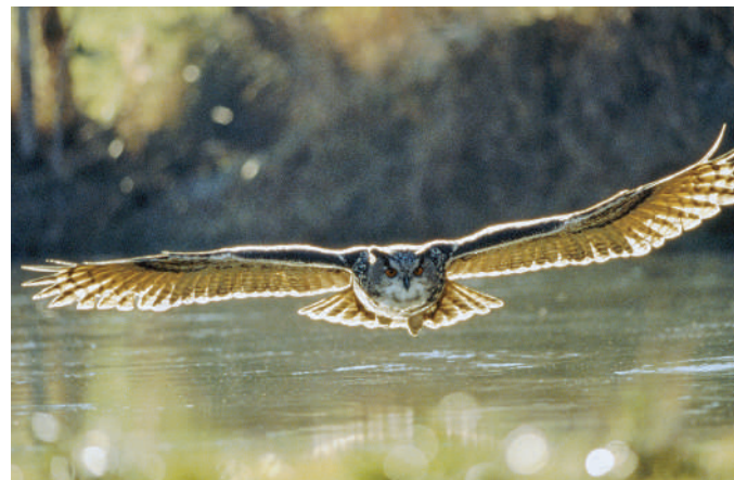
Soar point: should the eagle owl be allowed to repopulate Britain?